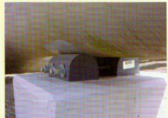
Supports Without Clamps