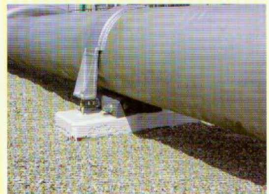
Pipe Clamp and Support